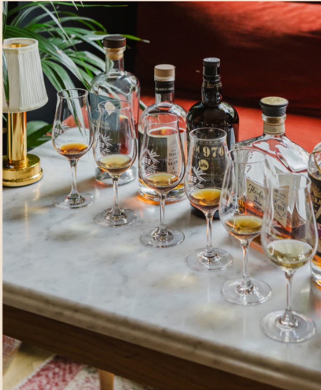
Guided tasting From €8 per glass of rum