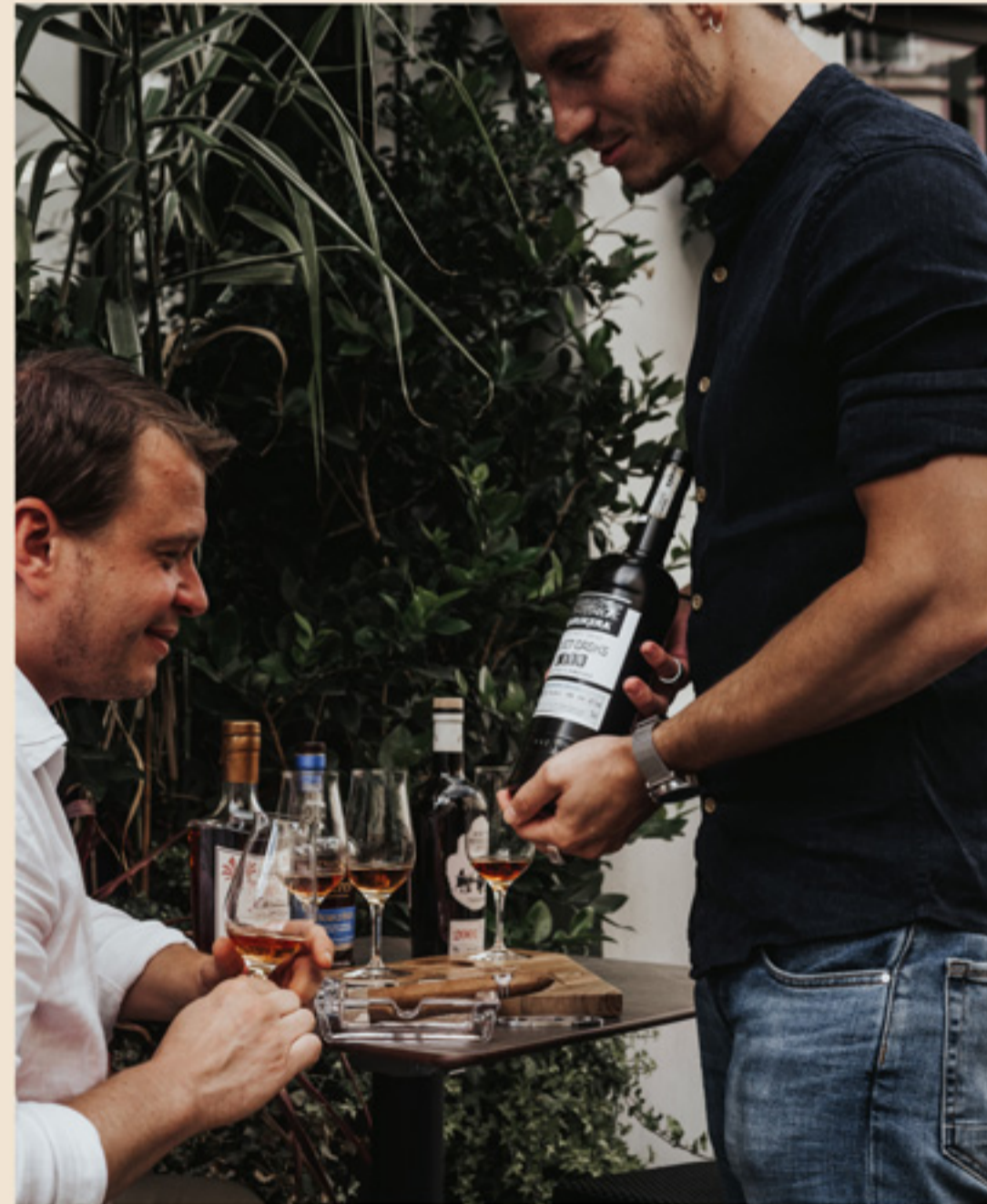
Rum masterclass À partir de 40€ / personne